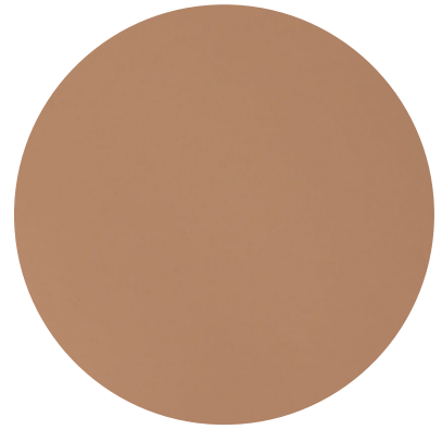
Bronze toughened mirror