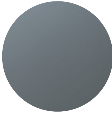
Grey toughened mirror